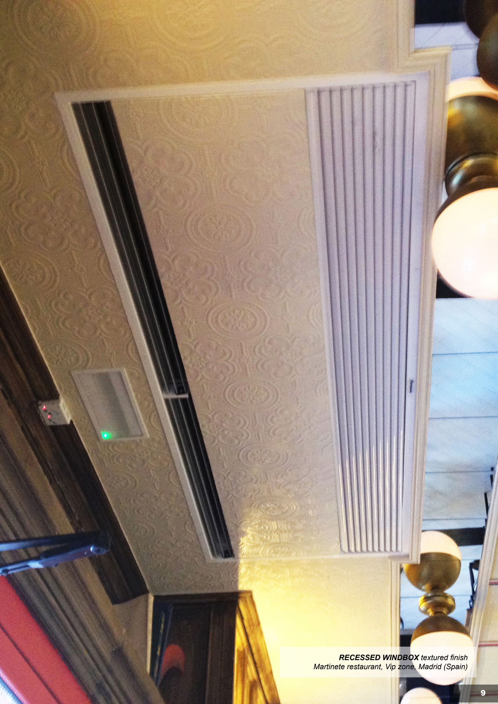
RECESSED WINDBOX textured finish Martinete restaurant, Vip zone, Madrid (Spain)