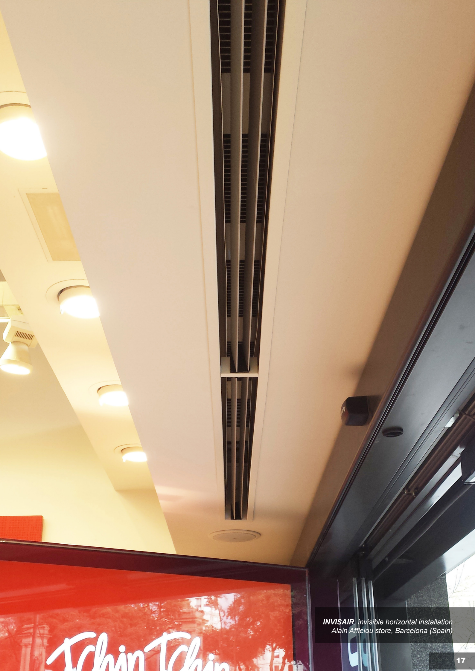
INVISAIR , invisible horizontal installation Alain Afflelou store, Barcelona (Spain)