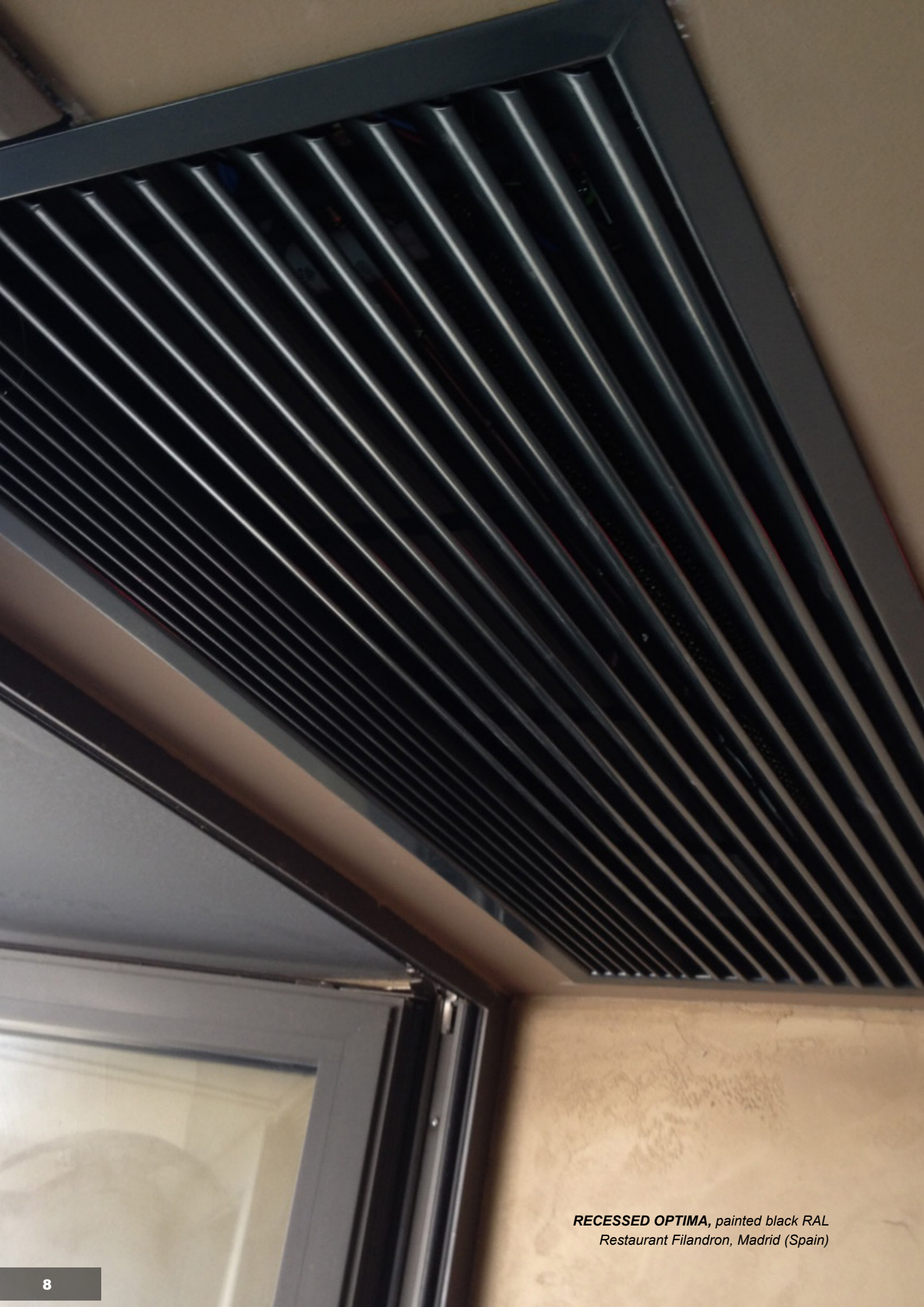
RECESSED OPTIMA , painted black RAL Restaurant Filandron, Madrid (Spain)