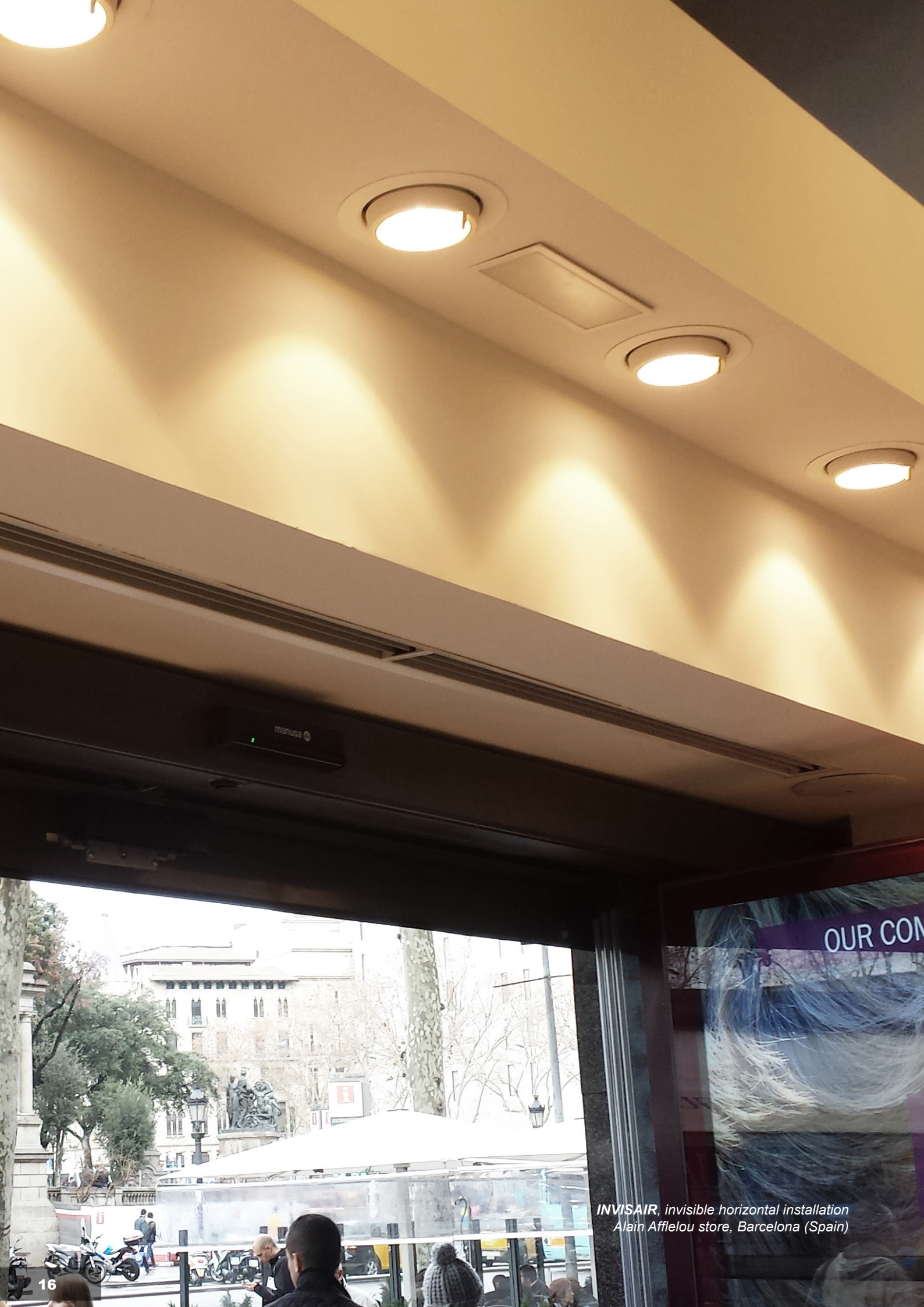
INVISAIR, invisible horizontal installation Alain Affelou store, Barcelona (Spain)