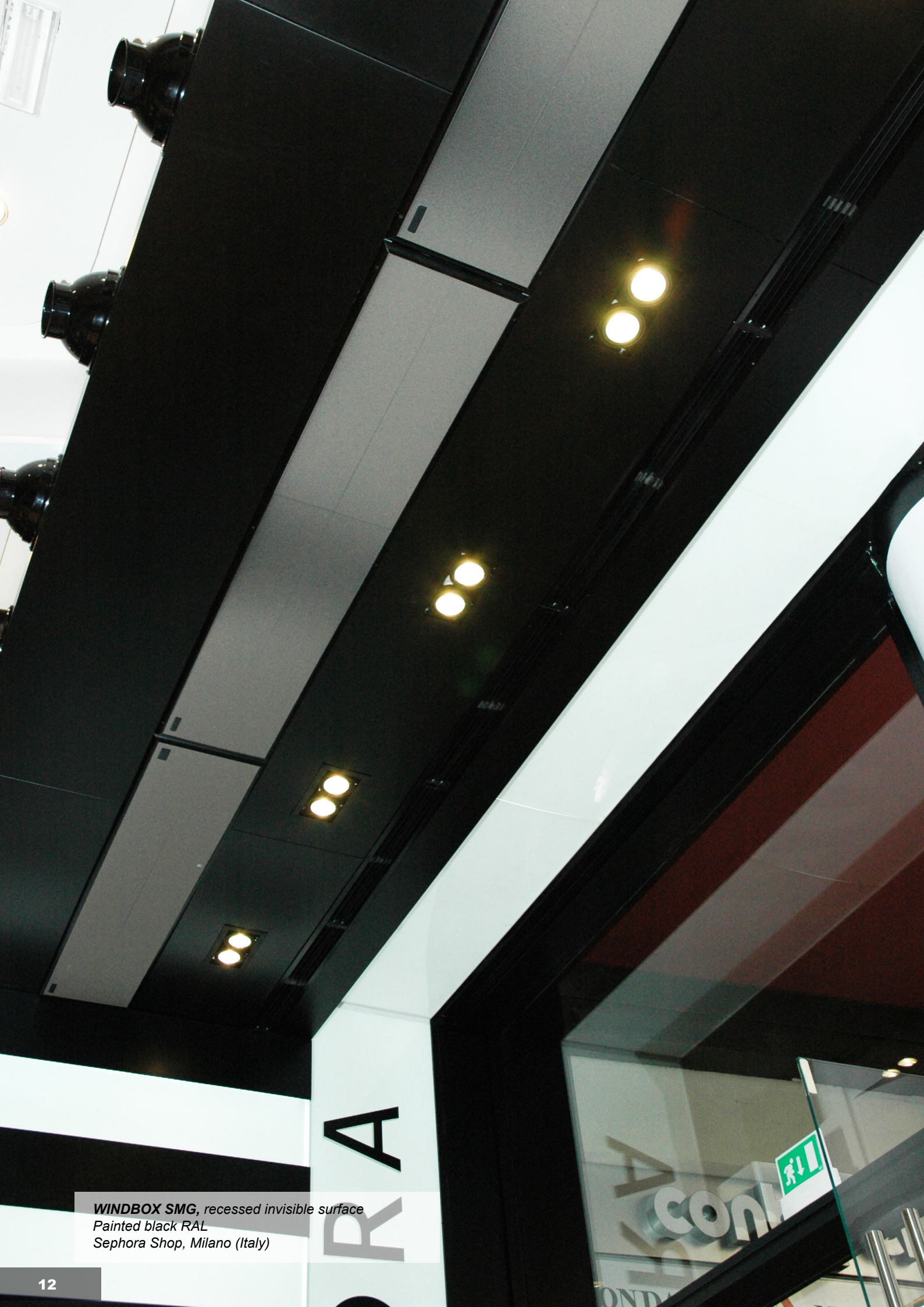
WINDBOX SMG , recessed invisible surface Painted black RAL Sephora Shop, Milano (Italy)