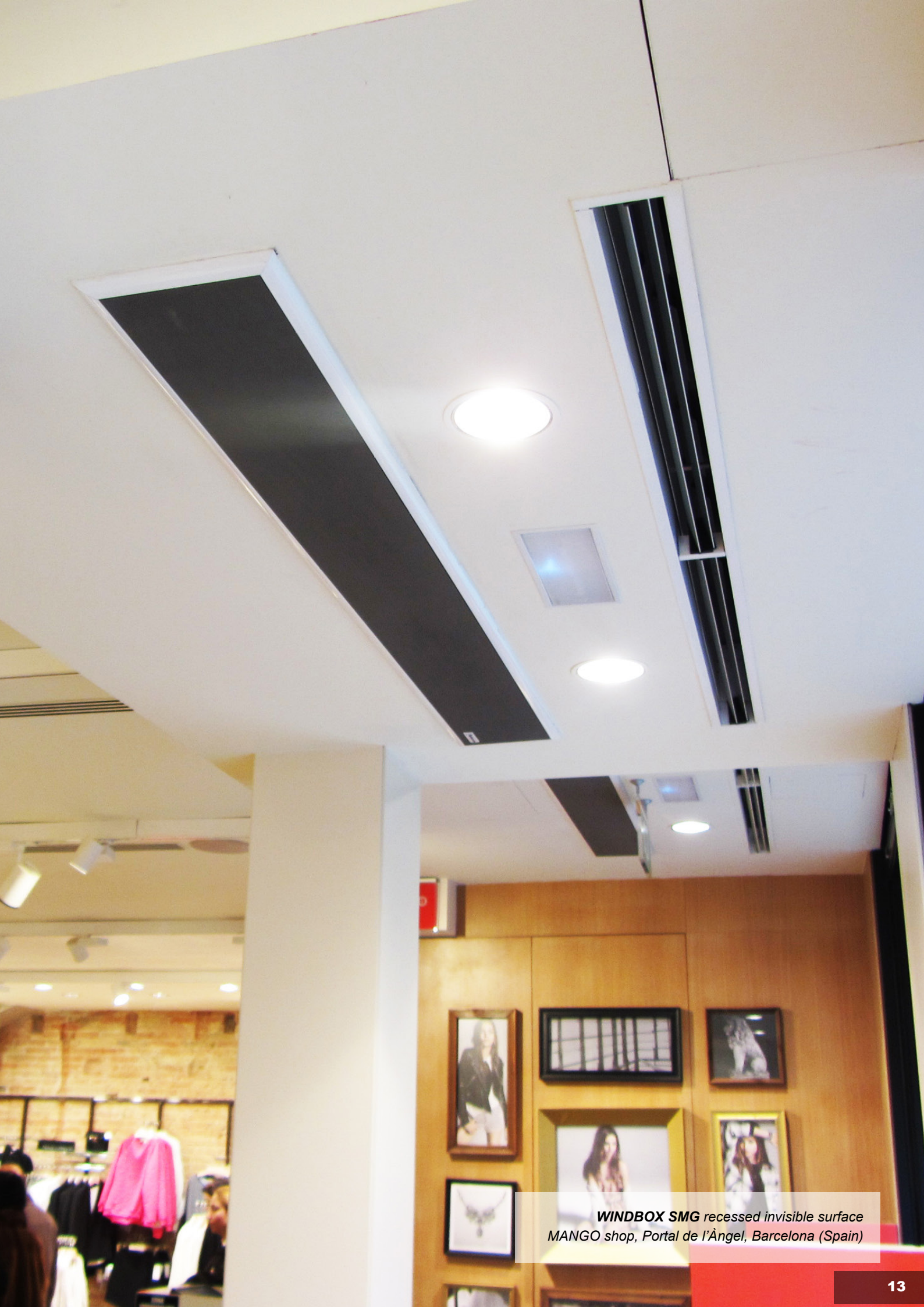
WINDBOX SMG recessed invisible surface MANGO shop, Portal de l'Àngel, Barcelona (Spain)